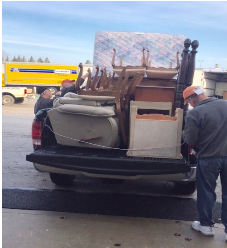
Volunteers Loading Family's truck on Selection Saturday

The EFM volunteers are dedicated individuals who are filled with compassion for helping those in need. Lifting furniture, sorting goods, and loading trucks is hard work but no one ever complains. Most volunteers can't believe the fun they are having doing God's work.